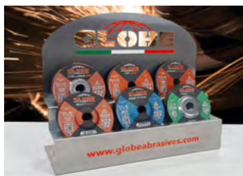
Stainless steel counter display. Dimensions: 45x24 cm with 6 slots for discs from 115 to 125 mm..