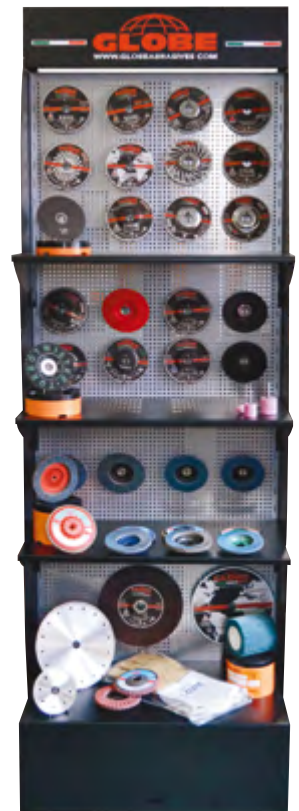
Thin sheet floor display. 65x42x192 cm composed by: 1 perforated wall, 3 shelves 2 side edges, 1 base with drawer.