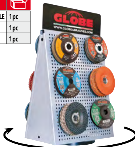
Rotating counter display: perforated sheet metal like the floor display. Can hold 12 discs' types (6 each side) of 115/125 mm. Practical, very capacious and not bulky: 18x30 cm.