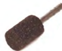
BLACK | STAINLESS STEEL

GLOBE shaft-mounted wheels are suitable for grinding and finishing operations. The different specifications can be distinguished by the color: