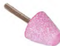
PINK | STEEL