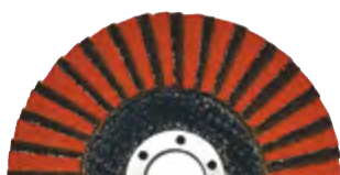
ULTRA COARSE (CERAMIC)

FINISHING PRO was born from the idea of creating a new generation flap disc by combining normal flaps of abrasive cloth with non woven flaps, typical of finishing discs. Abrasive cloth flaps are for "roughing" while non woven flaps (due to their fine grit) polish metal giving it a very low surface roughness and a shiny aspect. The ceramic version allows a removal speed that is at least double compared to that of corundum discs and it lasts 50% more. Suitable for quick roughing operations and for use before carrying out different finishing jobs that can be obtained with ultra coarse, coarse, medium and fine grits.