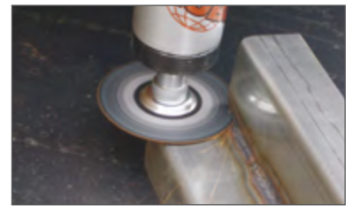
Thin cutting disc Safecut DC: 75x1,0x9,53 A60SX