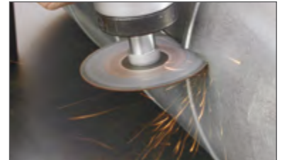
Thin cutting disc ZIP HP: 75x1,0x9,53 A60SX