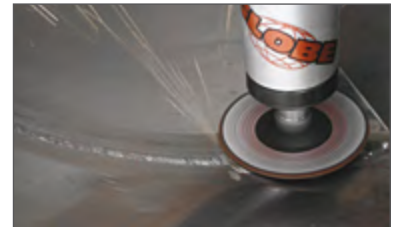
TurboTwister: Ø75 mm, GRIT 36