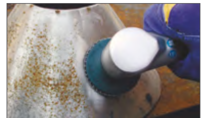
Flap disc: Ø75 mm, GRIT 40