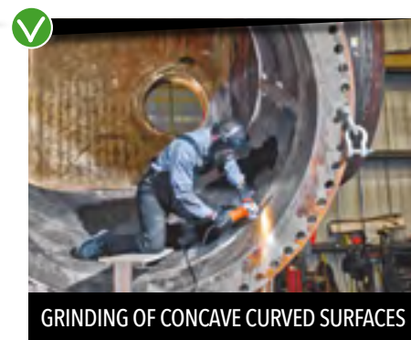
GRINDING OF CONCAVE CURVED SURFACES