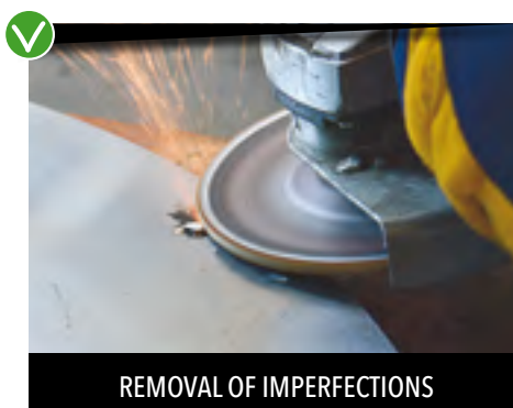
REMOVAL OF IMPERFECTIONS