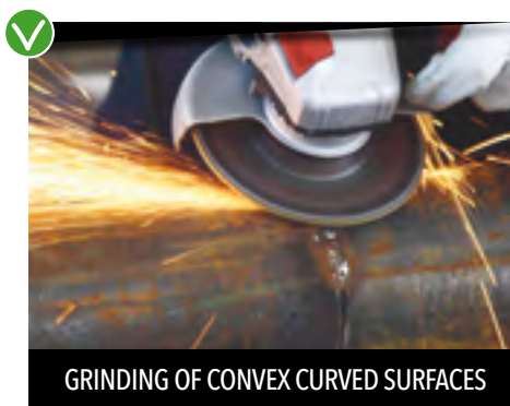
GRINDING OF CONVEX CURVED SURFACES