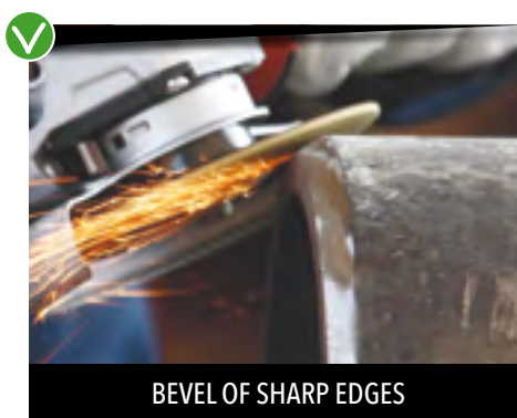
BEVEL OF SHARP EDGES