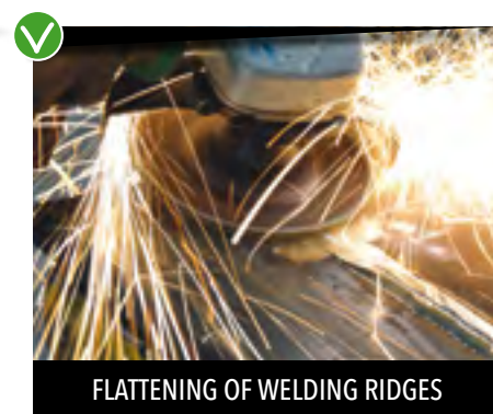
FLATTENING OF WELDING RIDGES