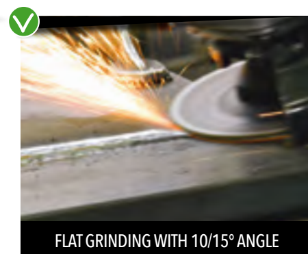
FLAT GRINDING WITH 10/15° ANGLE