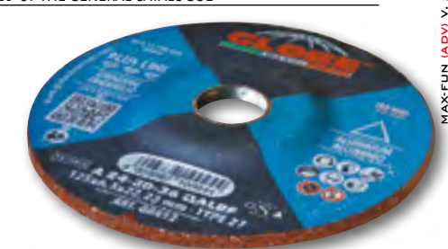
PAGE 48 OF THE GENERAL CATALOGUE